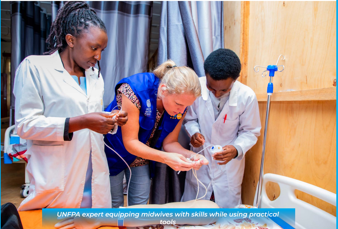
UNFPA expert equipping midwives with skills while using practical tools

The Associate Nursing Program in upper secondary level education was equipped with quality simulation laboratory equipment. The simulation lab equipment will provide 630 nursing students annually with quality education through simulation based training.