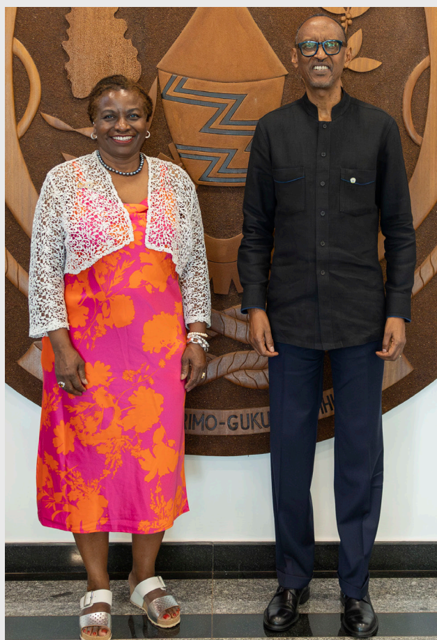
President Paul Kagame welcomes Dr. Natalia Kanem, UNFPA Executive Director