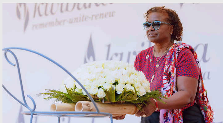
Executive Director pays tribute to the victims of 1994 Genocide against the Tutsi